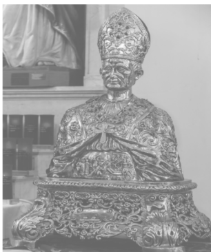
The Shrine Church of The Most Precious Blood is The National Shrine of San Gennaro

ONCE AGAIN, A HAPPY AND BLESSED FATHER'S DAY TO ALL!